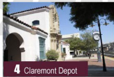
4 Claremont Depot