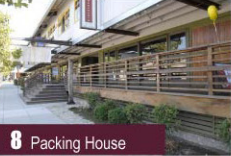
8 Packing House