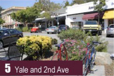
5 Yale and 2nd Ave