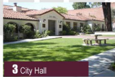
3 City Hall