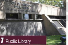
7 Public Library