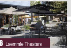
6 Laemmle Theaters